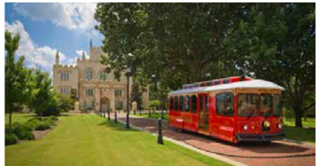
The City of Milledgeville Main Street/Downtown Development Authority Program has been designated as a 2020 Accredited Main Street America™ program.