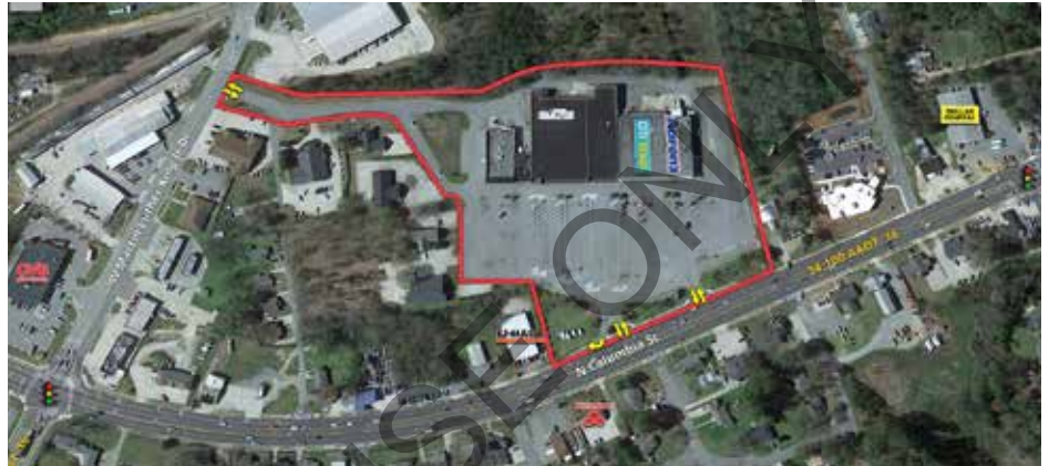
View of the property as currently stands.

Harbor Freight approached GGD/Rhino to help them acquire this new location, even though they have competitors nearby in Lowe's, Ace Hardware and even Walmart. Harbor Freight manufactures their own products, so they are able to offer a more affordable price than their competition. Given that this area has a lower media income than the national average and it is an industrial/manufacturing hub and a "college" town, these factors all play into Harbor Freight's target demographic.