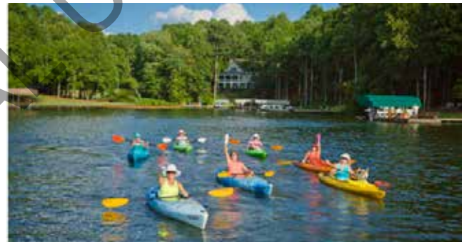
"Cleanest Lake in the State"