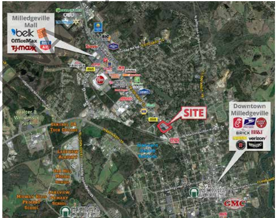
View of the surrounding properties with selected business highlighted.