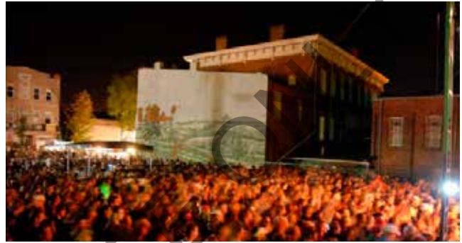
Budget Travel's "Top 10 Coolest Small Towns in America"!